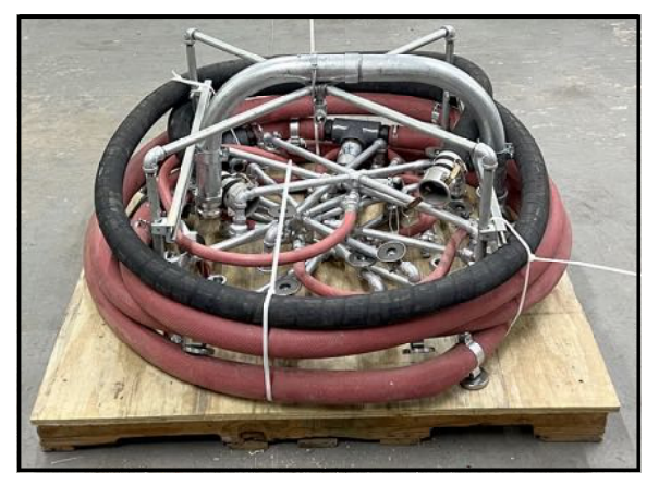
FracAir fits on 4 ft x 4 ft pallet

Remtech's FRACAIR system can be supplied with a pressure reducer and flow regulator for supplied air from high pressure tow behind compressors or plant air.