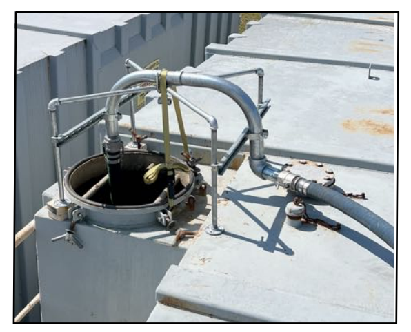
Anti-Siphon Manhole Light Cage Mounted on Frac Tank