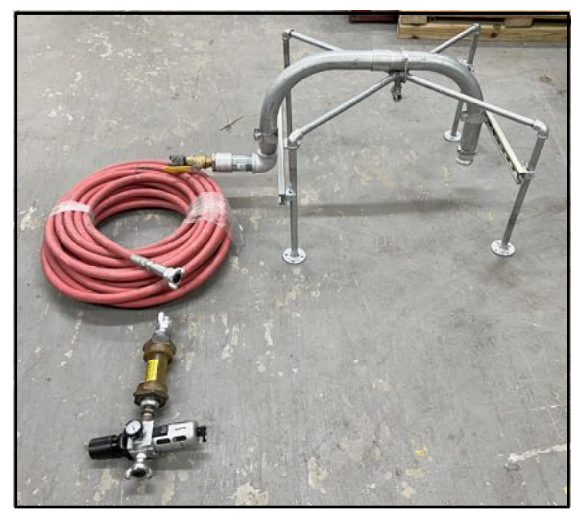
Compressor Air Control Valve & Anti-Siphon Light Cage