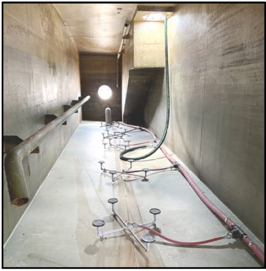
FRACAIR Magnetic Aeration Wastewater and Water Treatment System