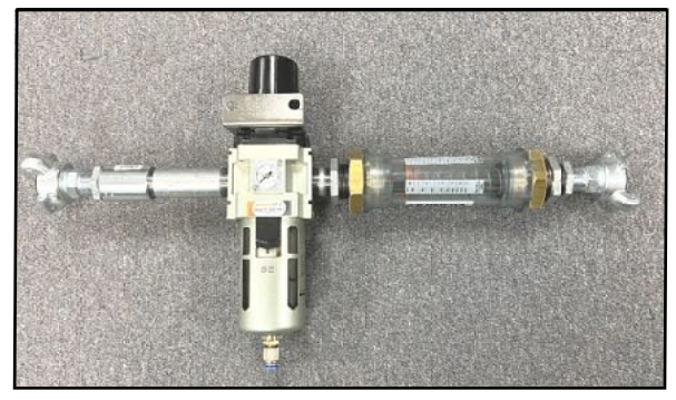
Air Pressure Reducer and Air Flow Regulator