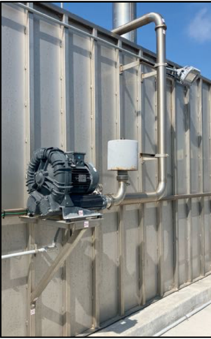
Blower Side Mount Tank Option

Remtech has developed a proprietary magnetic wastewater and water treatment system for domestic and industrial wastewater and contaminated groundwater. FRACAIR converts conventional FRAC TANKS into treatment systems with life spans up to 30+ years.