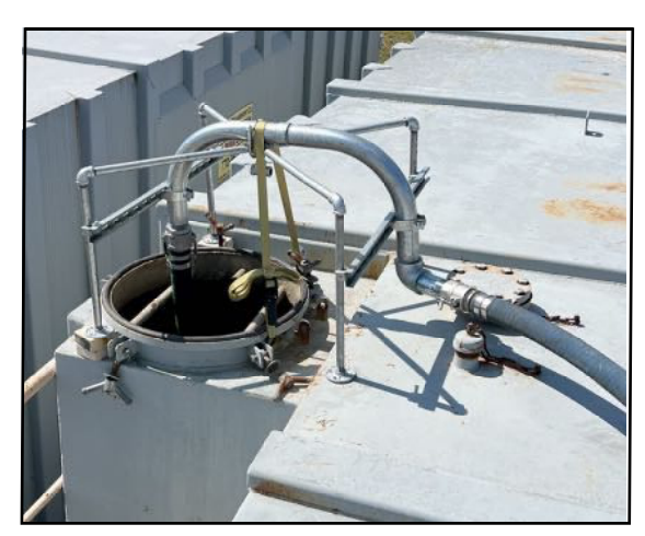
Anti-Siphon Light Cage Mounted on Frac Tank