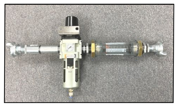
Air Pressure Reducer and Air Flow Regulator