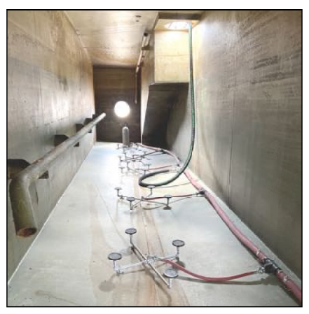
Remtech FRACAIR Magnetic Aeration System with Membrane Disc or Sintered Diffusers

Remtech has developed a proprietary magnetic modular wastewater treatment system that converts conventional rental FRAC TANKS into temporary mobile water and wastewater treatment systems during plant cleaning, repairs, or expansions. The FRACAIR Magnetic Aeration System provides adjustable airflow and retention times, enabling creating aerated grit chambers, equalization basins, flocculators, clarifiers, biological treatment, activated sludge, and sludge thickeners for biological or physiochemical treatment.