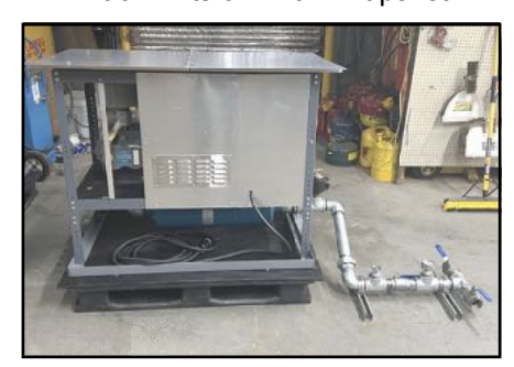
Remtech's 5 Hp Single Phase Rotary Lobe Blower with Weather Enclosure