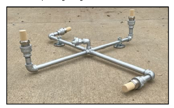
Sintered Diffusers Can be Rotated for Bottom Mixing