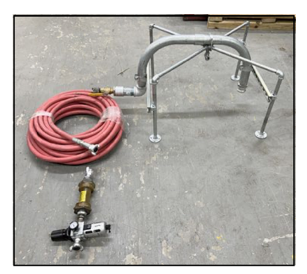
Compressor Air Control Valve & Anti-Siphon Light Cage

(for 185 cfm Trailer Mounted Compressor Air Supply (Patent Pending)