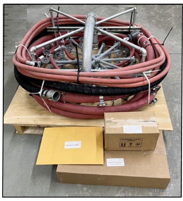
FracAir Ships on 4 ft x 4 ft pallet

Remtech's FRACAIR system can be supplied with a pressure reducer and flow regulator for supplied air from high pressure tow behind compressors or plant air.