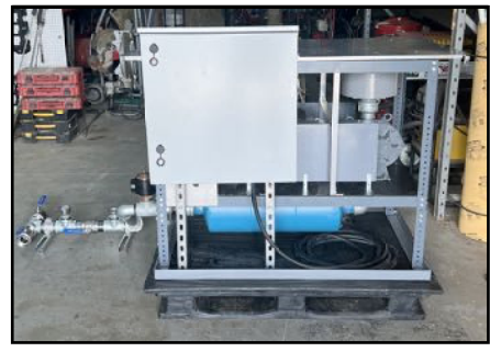
Remtech's 7.5 Hp 3-phase Rotary Lobe Blower with Weather Enclosure