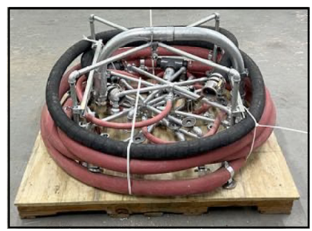
FracAir fits on 4 ft x 4 ft pallet