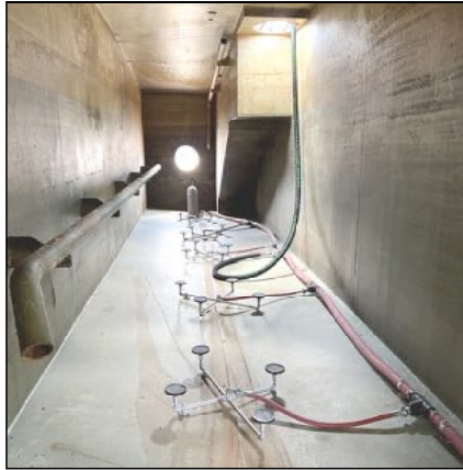
Remtech FRACAIR Magnetic Aeration System with Membrane Disc or Sintered Diffusers

Remtech has developed a proprietary magnetic modular wastewater treatment system that converts conventional rental FRAC TANKS into temporary mobile water and wastewater treatment systems during plant cleaning, repairs, or expansions. The FRACAIR Magnetic Aeration System provides adjustable airflow and retention times, enabling creating aerated grit chambers, equalization basins, flocculators, clarifiers, biological treatment, activated sludge, and sludge thickeners for biological or physiochemical treatment.