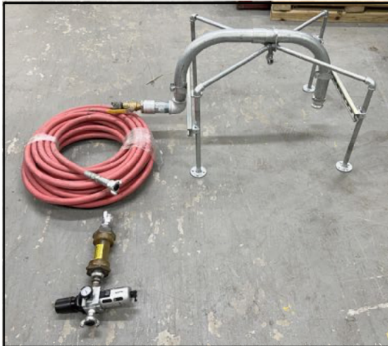
Compressor Air Control Valve & Anti-Siphon Light Cage