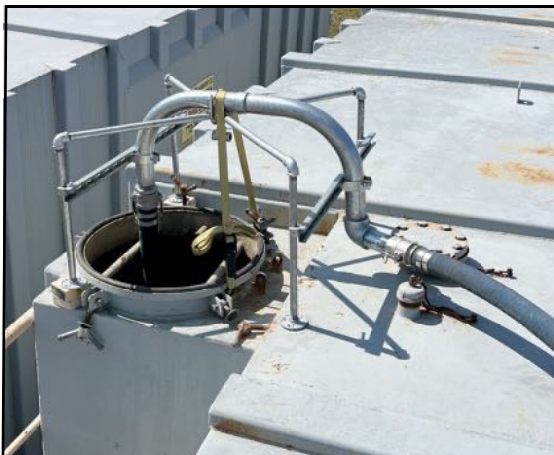
Anti-Siphon Light Cage Mounted on Frac Tank