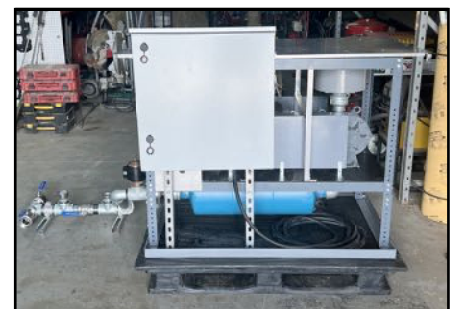
Remtech's 7.5 Hp 3-phase Rotary Lobe Blower with Weather Enclosure