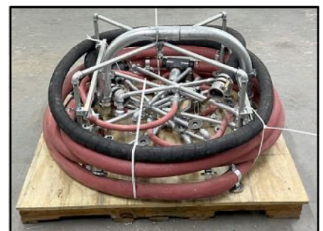
FracAir fits on 4 ft x 4 ft pallet