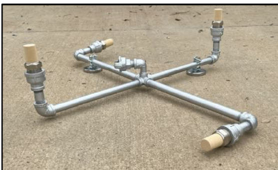
Sintered Diffusers Can be Rotated for Bottom Mixing

Remtech's FRACAIR system can be supplied with a pressure reducer and flow regulator for supplied air from high pressure tow behind compressors or plant air.