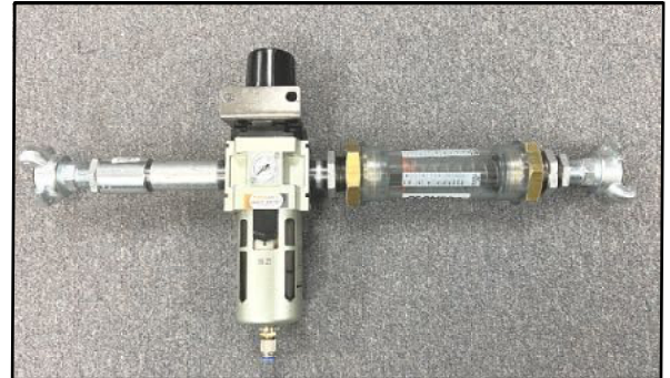
Air Pressure Reducer and Air Flow Regulator