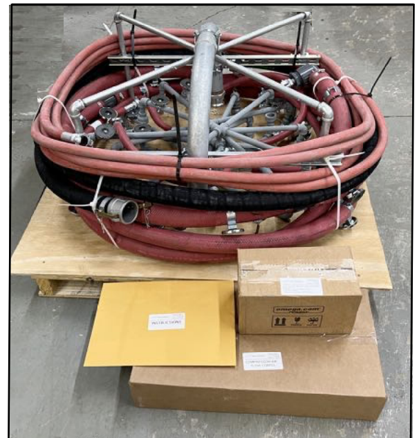
FracAir Ships on 4 ft x 4 ft pallet