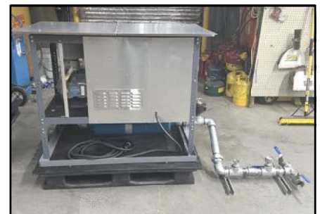
Remtech's 5 Hp Single Phase Rotary Lobe Blower with Weather Enclosure