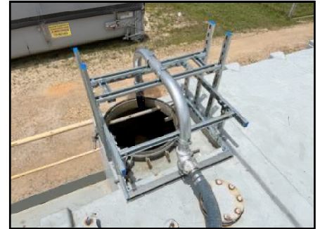
Anti-Siphon with Check Valve Inlet Cage Prevents Water Backflow to Blower

For more information, view a short YouTube Video located at .... https://youtu.be/iPHvSfxNyll or contact Remtech at remtech-eng.com and click on Store, Magnetic Aeration System.