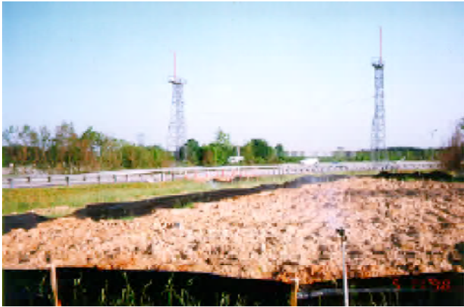
HC-2000 Bioremediation Bed With Auto Sprinkler System