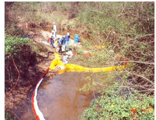
Creek Fuel Cleanup Operations