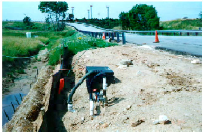
Bank HC-2000 Treatment System