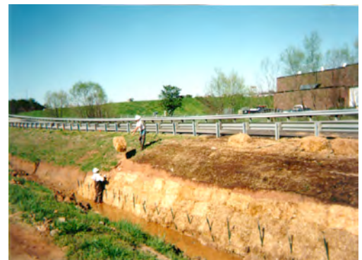
Bank HC-2000 Bioremediation & Stabilization System