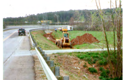
Transfer of Contaminated Soils to HC-2000 Biobed

Remtech trained airport personal to maintain the bioremediation systems and reduce project costs. Remediating soils onsite with HC-2000 minimized the number of site access and resident time that met airport authority security and aircraft safety requirements.