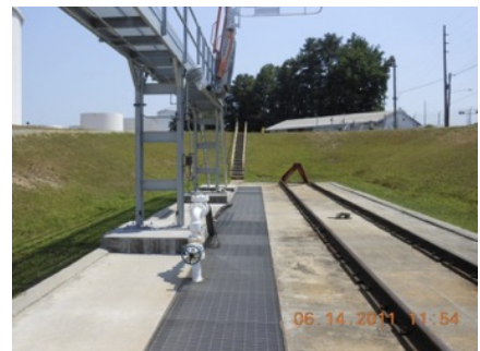
Concrete Spill Diversion Trench Flows to Existing Tank Farm Secondary Containment