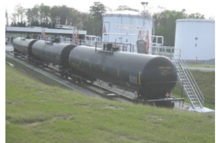
Completed Ethanol Railcar Unloading Rack

This project was completed on schedule and budget. The contractor was held responsible for removing and reinstalling inadequate rack footings caught by Remtech.