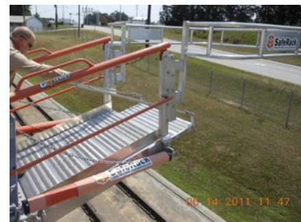
Hydraulically Operated Railcar Access Gantry